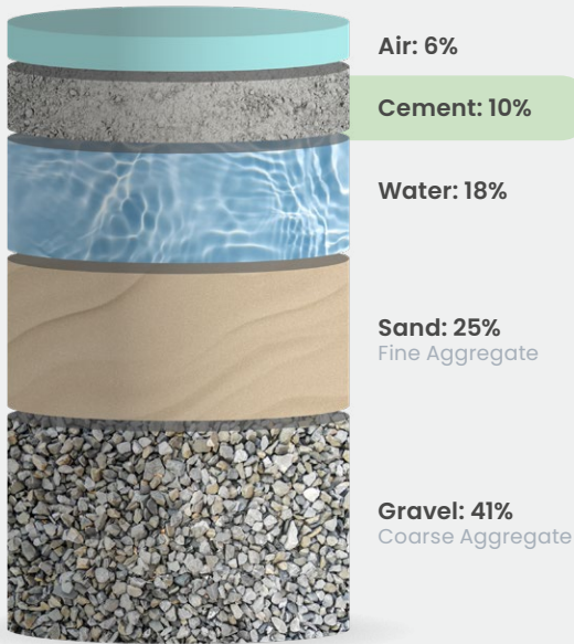
Typical Concrete Proportions

What happens when you replace a percentage of your cementitious with ProZERO™ Carbon Negative Blend?